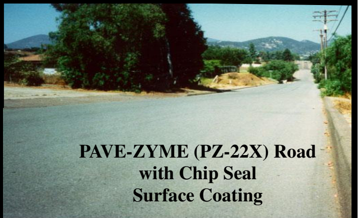
PAVE-ZYME (PZ-22X) Road with Chip Seal Surface Coating

Improving rural roads helps better the condition of the poor by improving access to essential services; schools; improving health and safety; and by facilitating the transport and sale of agricultural goods and overall economic progress.